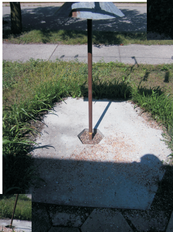
Bird feeder's huge hexagon