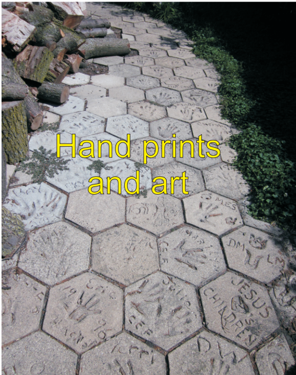
Hand prints and art