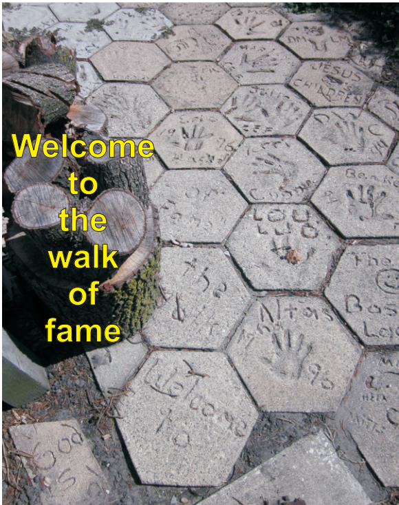
Welcome to the walk of fame