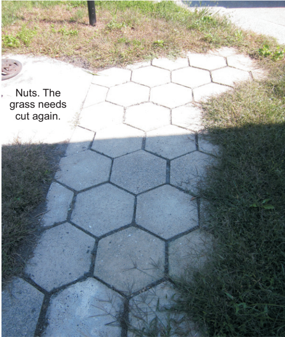
Nuts. The grass needs cut again.