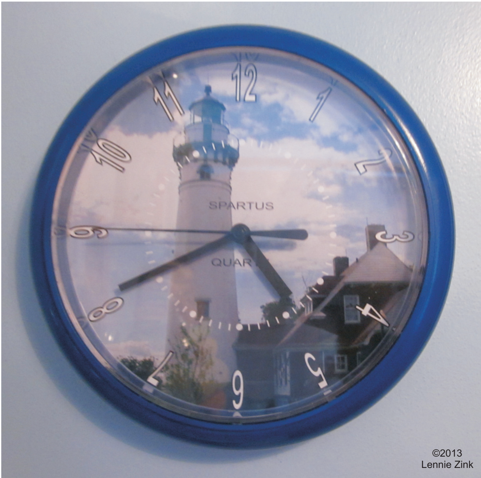
Photo Clock Face

Have you given any thought to making your own personalized clock faces?